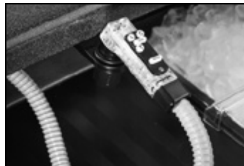
Premium quality 5-button, post-mix soda gun by Wunder-Bar® with fast, low foaming delivery. (shown on Cambar650DS model)